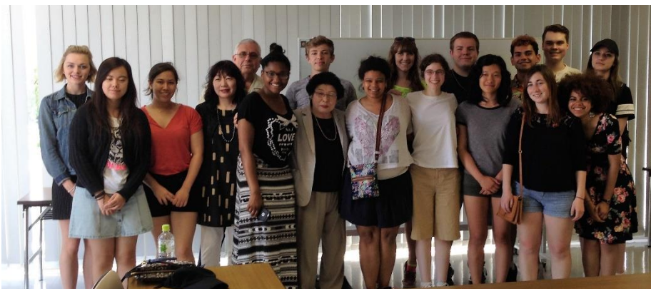
University of Michigan May 19, 2016

Outside visitors, usually in groups, have begun more and more to request our Hibakusha talks and Peace Park tours. Because the outside groups do not stay overnight at WFC, they make a contribution to WFC. We had 3 people in March and 13 people in April request these services. In May, we had a group of 16 from Butler University and in June, we will have a group of 21 from Envoys, a company that specializes in global education programs.