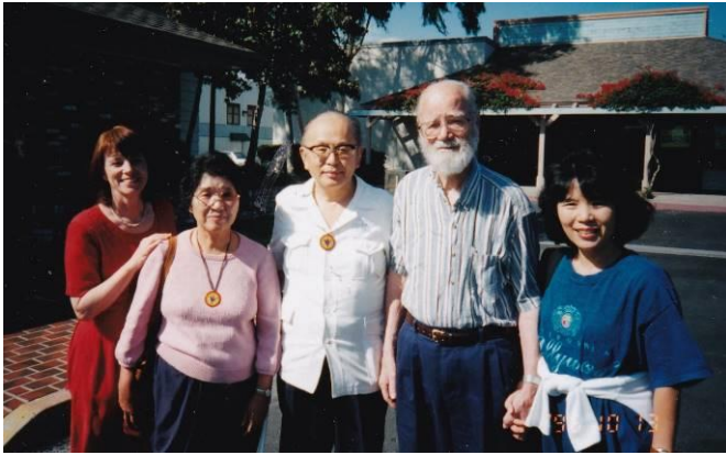
1996 American PAX