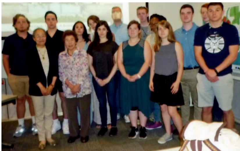
Butler University, Indianapolis May 31, 2016