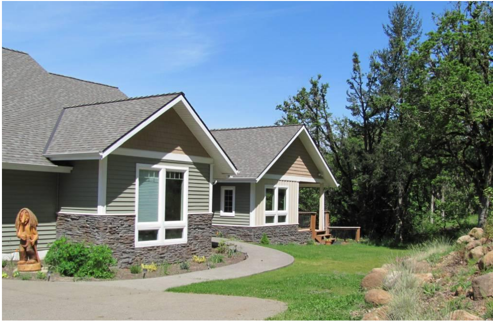
(PAX will visit our house in Oregon, USA.)