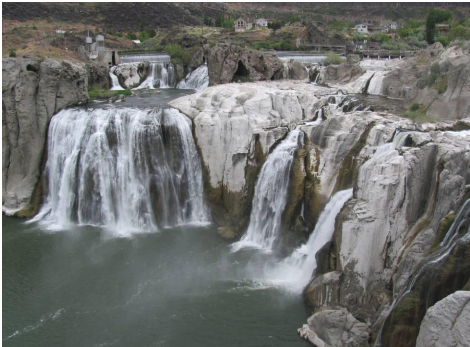
(Twin Falls, Idaho, USA, near Minidoka Internment Camp)