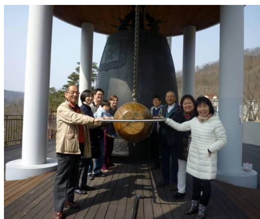
"World Peace Bell"