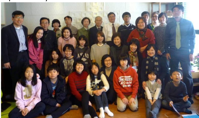
(Sunday service at Jesus Heart Church)