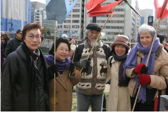
Peace Walk 2008