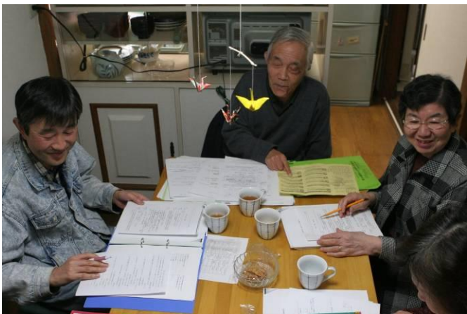
NPO Planning Session