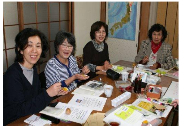
Wednesday afternoon Class