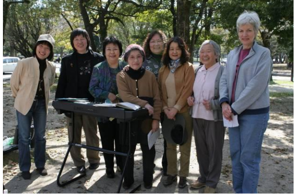
Peace Choir sings in Peace Park